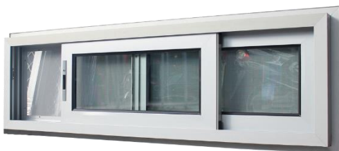
Figure 1 small window